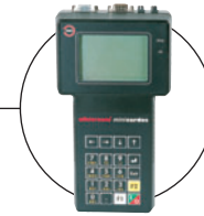
MINICARDOS Sold Separately Item #213940