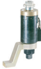
HSD Hand Multiplier Sensor Controlled