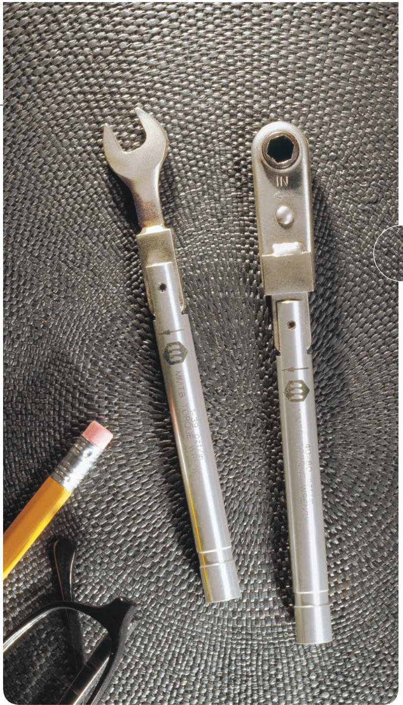
MMTB's shown at actual size.